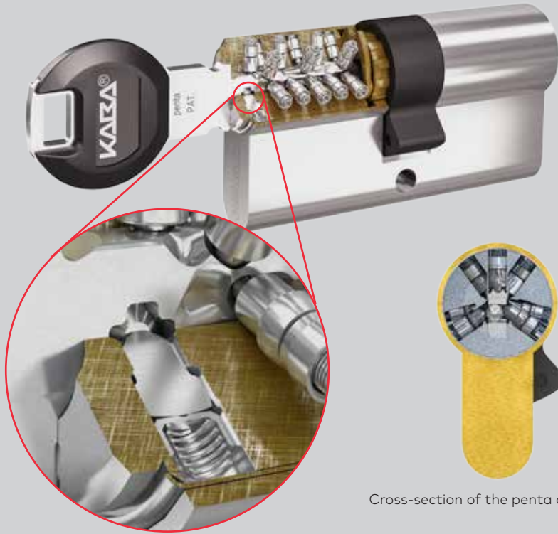
Cross-section of the penta cross cylinder